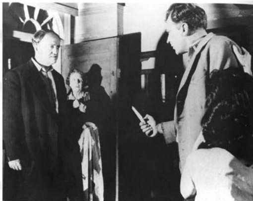
Print Source: IFI Irish Film Archive

Feature film adapted from Walter Macken's stage play of the same name; lead role played by Walter Macken.